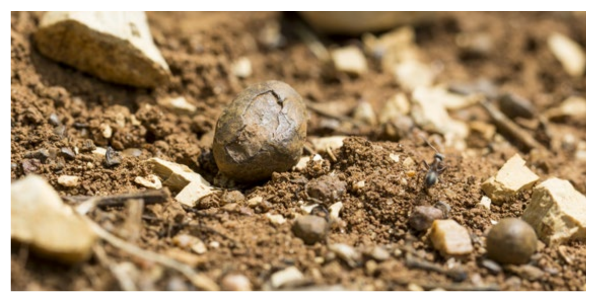
Ferruginous concretions on the red clay of the Château de Haute-Serre