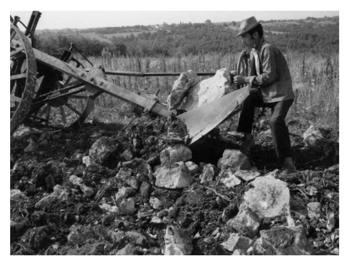
Crushing stones at Château de Haute-Serre when re-planting

The Cahors vineyard is considered as one of the oldest in Europe, and could be at least 2000 years old. Much appreciated from the beginning, it rose during the 12th century with the English, boosted by the marriage of Eleanor of Aquitaine to Henry Plantagenet.