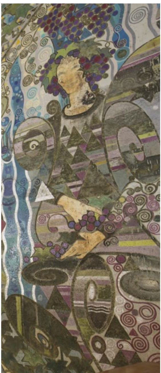
Fresco painted by Christine de Beauchêne in 1992