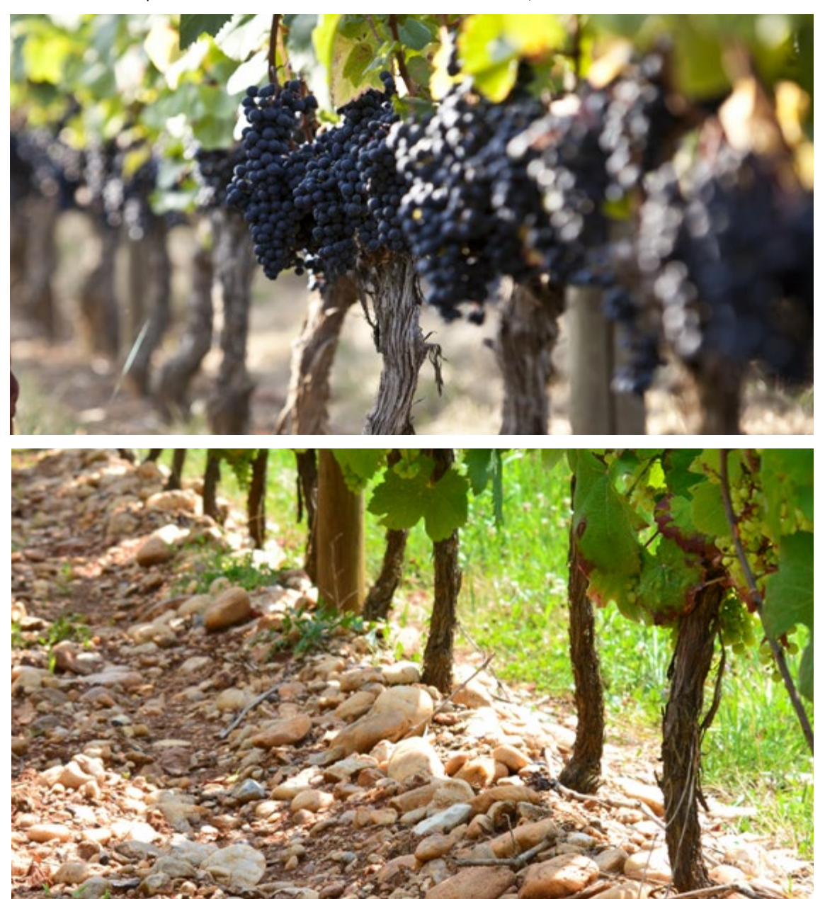
Silicious clay from the former quaternary period of the Château de Mercuès

Located on the third terraces of the Lot Valley, on the high 500.000 year old Mindel terrace, the Mercuès vineyard has the distinguishing feature of being composed of Causse limestone scree enriched with ancient alluvial, producing the most famous Cahors, which are rich with great ageing potential.